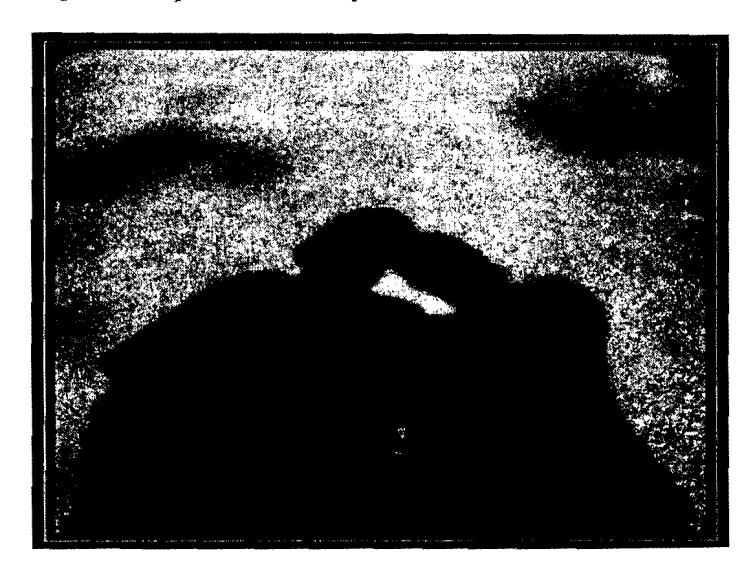
Treatment Can Be Successful

Psychiatric Evaluation Comply With Prescribed Medications Psychotherapy/Pastoral Counseling 52 Week Domestic Violence Treatment Program No Contact With Victim Until Completing Treatment Program Attend NA/CA/AA Meetings If Using Drugs/Alcohol Request Help From Family & Friends