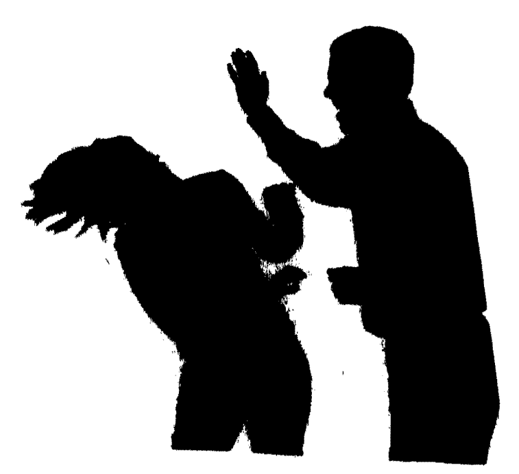
Domestic Violence Among Native Americans

7<sup>th</sup> Generation United American Indian Foundation