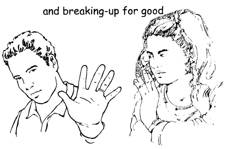
You should not have to be afraid to break-up with your dating partner